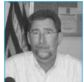
Dale Petersen - Mayor of Sergeant Bluff since 2002.