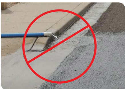
Improper draining of pool backwash onto impervious surface leading to a storm sewer intake.

Dan Hospers City of Sergeant Bluff Storm Water Coordinator