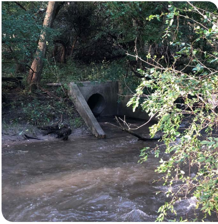
Chlorinated and saltwater can directly enter nearby streams if discharged into a storm sewer intake (ISWEP)