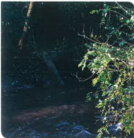
Chlorinated and saltwater can directly enter nearby streams if discharged into a storm sewer intake (ISWEP)