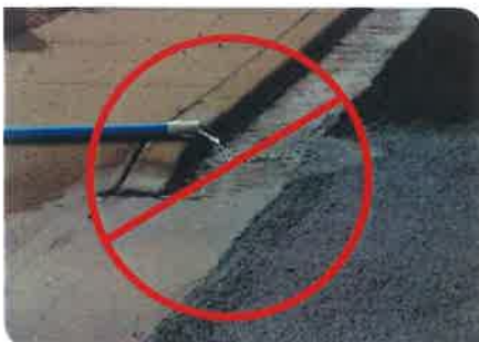
Improper draining of pool backwash onto impervious surface leading to a storm sewer intake. (Cape Water Harvest)